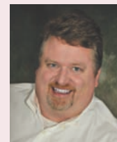
Serving St. Helens, Scappoose and Vernonia

Securities offered through LPL Financial, member FINRA/SIPC. Insurance Products offered through LPL Financial or it licensed affiliates. LPL Financial is not affiliated with Wauna Federal Credit Union