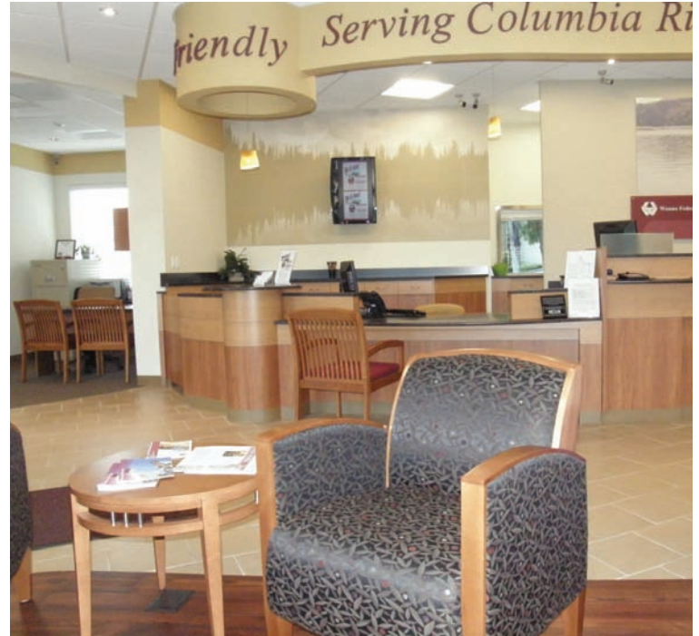
Energy efficient lighting enhances the Branch lobby

Additional details about the Scappoose Branch are available on the Credit Union web site.