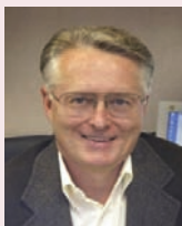
Serving Astoria, Clatskanie and Warrenton