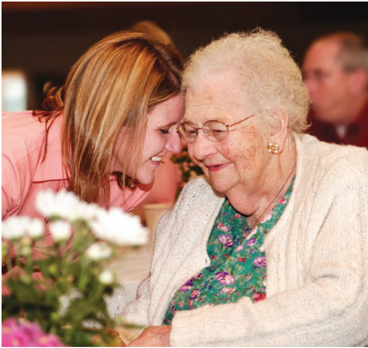
All your relatives are eligible for membership with Wauna FCU.