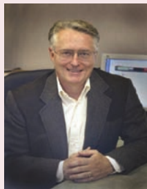
Astoria, Clatskanie, Vernonia, Warrenton

Contact an LPL Financial Advisor at a branch near you (1-800-773-3236) . We can help you develop a sound financial plan suited to your specific situation, monitor that plan occasionally to ensure you're making progress toward your objectives, and recommend adjustments as needed to help you stay on course.