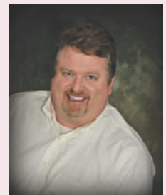
St. Helens, Scappoose